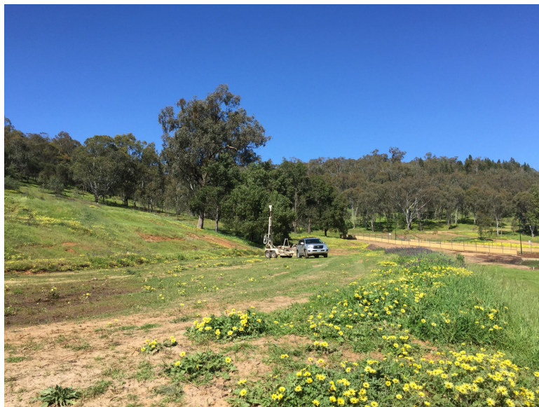
Existing site conditions for proposed dwelling.

1.1 The allotment is part of the "Sienna Ridge Estate" Hamilton Valley, Stages 1 and 2. This particular block is positioned on the side of a hill and as part of the subdivision earthworks two separate platforms have been formed across the allotment. The area allocated for the house is situated on the lower level with the surface being relatively level. Site drainage should be further enhanced with landscaping works at the completion of construction. At the time of the investigation there was a patchy cover of vegetation across the surface and a number of trees along the southern boundary. It is understood these trees are still to be removed and cleared from the site.